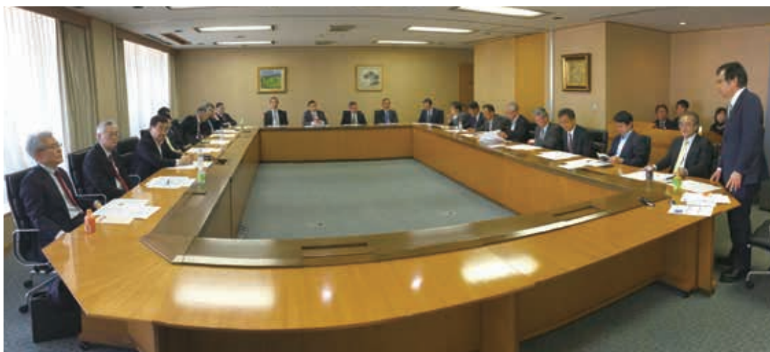
▲ RC Committee: Officer in charge of the Environment, Safety & Quality Assurance Department and the heads of the Production Technology Department, Personnel Department, Purchasing Department, business divisions, and all plants and laboratories. Meetings are held annually. (Chairman: Head of Environment, Safety & Quality Assurance Department)