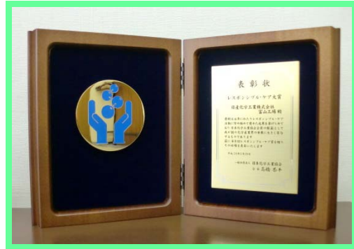
Certificate of Commendation