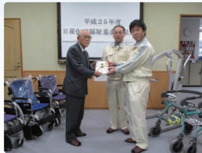
Provision of welfare equipment in Toyama district