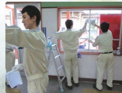
Beautification activities of JR Takayama-Line, Hayahoshi Station (Toyama Plant)