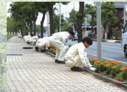
Greening activities (Onoda Plant)

Products that Contribute to the Society CSR Management Responsible Care Activities Together with our Stakeholders - Relationships with Consumers and Clients - Together with our Stakeholders - Employees - Communication with the Society Site Report ISO 26000 Core Subjects Comparison Table