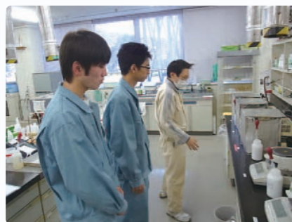
Testing work experience at Sodegaura Plant

In 2013, 12 students experienced testing work and observed manufacturing site at our laboratory and plant. We hope they will utilize this experience and play active role after their education.