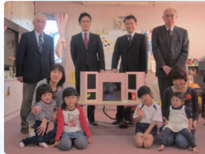
Provision of welfare equipment to the Fujimidai Kikoe to Kotobanoh Kyoshitsu (Fujimidai listening and language class)

In FY 2013, we donated to 40 organizations such as Council of Social Welfare and welfare facilities, in 16 regions.