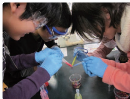
Let's make micro capsule (Narashinodai Daiichi Elementary School)

The Chemical Research Laboratories offered off-site chemical experiment classes at nearby elementary schools as part of their support activities for science education. The Biological Research Laboratories invited students from junior high schools in the city to experience the work of the Laboratories.