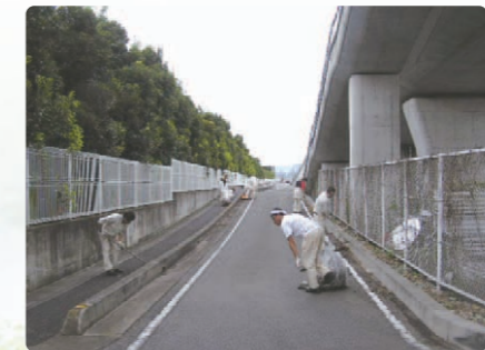
Surrounding area beautification activity (Saitama Plant)

At Sodegaura, Saitama and Nagoya Plants, we cleaned the public roads around the plants. Onoda Plant plants flowers along the road in front of the premise in collaboration with local community people in spring and fall, as an action to fill the Seimi Street with full of flowers. Furthermore, Toyama Plant works on cleaning and beautification of the nearby JR Takayama-Line, Hayahoshi Station.