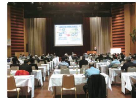
Participation in the RC Community Dialogue Meeting (Toyama/Takaoka District)