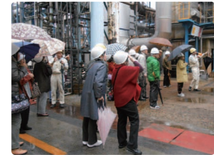
Plant tours of the residents in the area (Nagoya Plant)

In FY 2013, we participated in the Responsible Care Community Dialogue Meeting in Toyama/Takaoka district where Toyama Plant is located and Yamaguchi-nishi district where Onoda Plant is located.