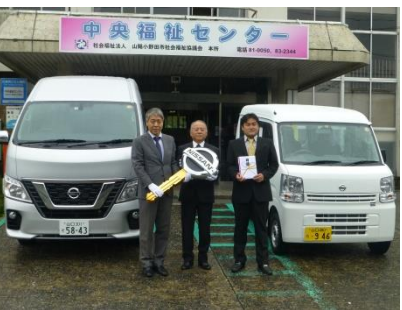
Presentation ceremony in the Sanyo Onoda area