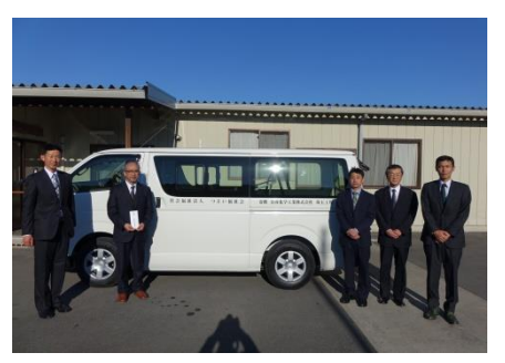
Presentation ceremony in the Saitama area

Contact information for inquiries on the above