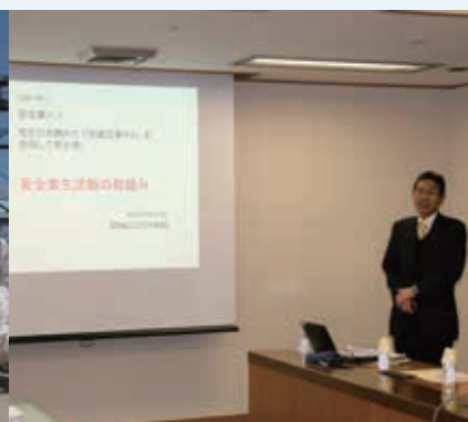
▲ Nissan Engineering, Ltd.