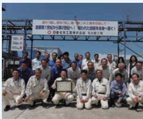
▲ Nagoya Plant

In FY2016, the award was granted to Nagoya Plant and Nissan Engineering, Ltd. for their achievement of zero accidents during the five years from FY2011 to FY2015. At the award presentation ceremony, a lecture was given by each winner about their countermeasures against accidents.