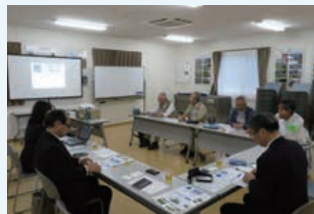
▲ A session for exchanging opinions about biodiversity conservation activities