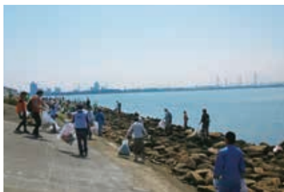
Nagoya Plant “Fujimae-Higata Clean-up Activities”