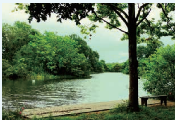
▲ Armand Bayou Nature Center

ABNC is one of the largest urban wilderness preserve in the U.S. ABNC contains 2500 acres of the natural wetlands forest, prairie and marsh habitats once abundant in the Houston/Galveston area. ABNC is home to over 370 species of birds, mammals, reptiles and amphibians. The Center's stewardship programs ensure that future generations have the opportunity to experience a wilderness close to home. ABNC's educational programs promote the value of preservation and conservation of natural resources. These programs also encourage everyone to incorporate ecological concepts into their daily lives.