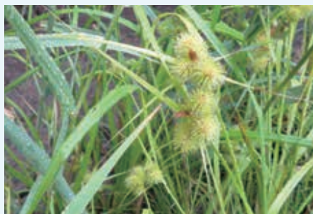
▲ Carex capricornis , an endangered species that the NPO has been growing successfully