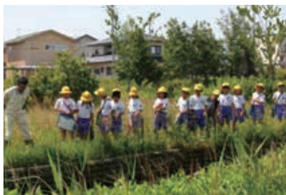
Toyama Plant “Nissan Bio-Park Nishi-Hongo”