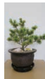
Sodegaura Plant “Support for the conservation of Pinus pentaphylla”