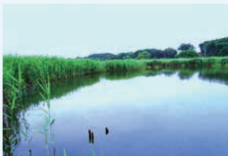
▲ Landscape of the area around Kurohamanuma Pond

Representatives from our CSR & Public Relations Office, Environment, Safety & Quality Assurance Department and Biological Research Laboratories visited the environmental learning center (Kankyo Gakushu-kan) in Hasuda City, which is managed by the NPO, observed its activities in the area around Kurohamanuma Pond, and then exchanged opinions with the NPO concerning activities of the NPO and the company, issues on biodiversity conservation, expectations for business enterprises and other aspects.